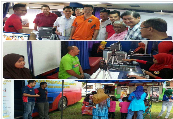
First Meeting of the Regional Steering Group on CRVS in Asia and the Pacific