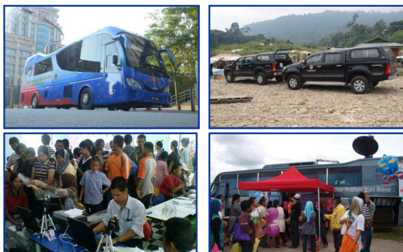
Online Mobile Set

First Meeting of the Regional Steering Group on CRVS in Asia and the Pacific