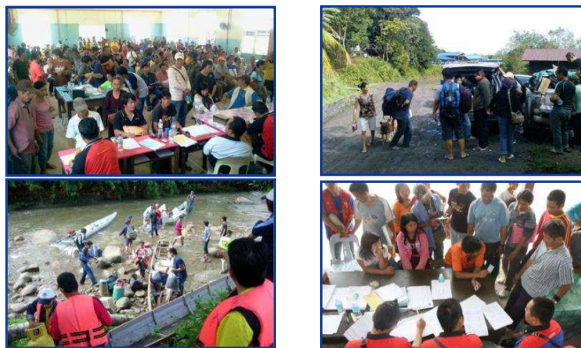
Outreach Programme in remote locations

First Meeting of the Regional Steering Group on CRVS in Asia and the Pacific