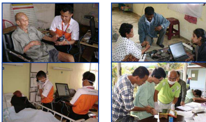
Outreach Programmes for senior citizens and with disabilities

First Meeting of the Regional Steering Group on CRVS in Asia and the Pacific