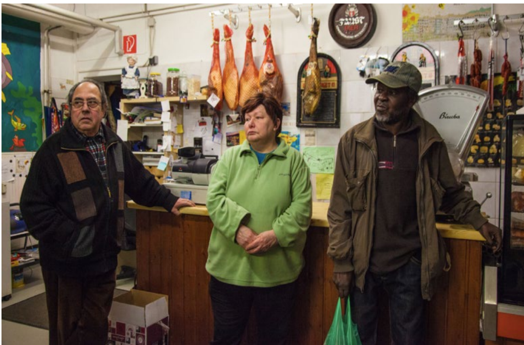
Figure 2: Kassel Grocery Shop.

By adopting the theme of ‘home’ rather than statelessness, stateless art interlocutors then inscribe their existence into European social imaginary. Portraying Palestine in terms of ‘home’ establishes the existence of Palestine as a home in the observers’ perception, a nation not internationally recognised. Similarly, photographer Moussa Ag Assarid from Azawad, an unrecognised proto-state in Mali, in his project ‘The Revolution is without Frontiers’ exhibits landscapes from Azawad draped in the Azawadian flag and signature of the National Movement for the Liberation of Azawad, which declared the