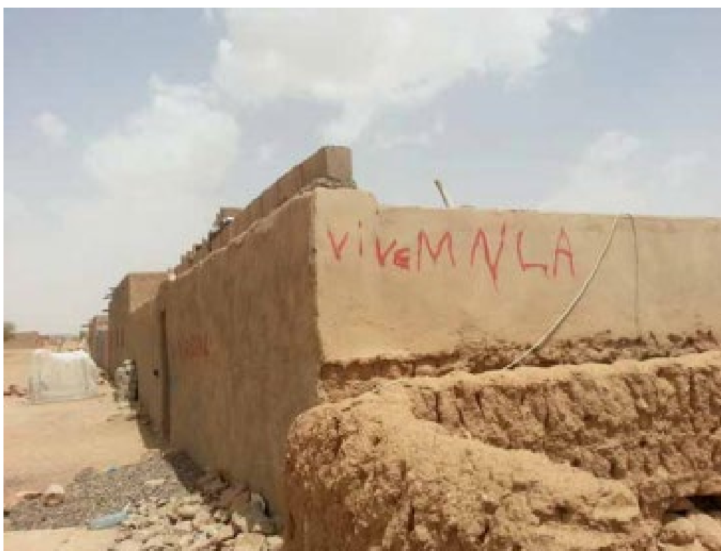
Figure 5: Graffiti in Kidal.

In contrast to the work of Shibli and Ag Assarid sewing the existence of their ‘home’ into European cultural libraries, Swaitat seeks to delocalise our understanding of home to show that it must not be tied to a state. Tendayi Bloom interestingly underlines how, in the discourse around statelessness, citizenship of a recognised state is constructed as the sole allocator of personhood and political