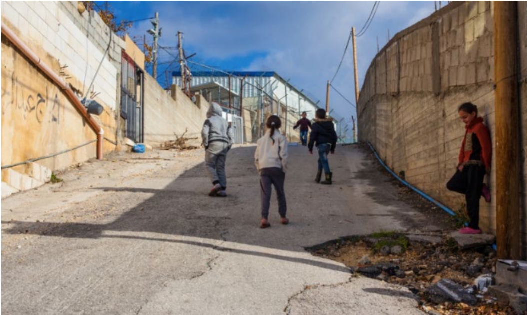
Figure 1: Al-Khalil/Hebron Road to Israeli Al Ja'abrah Prison.