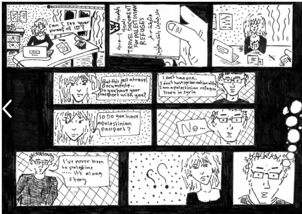
Figure 8: 'My Papers, My History' — 1948(1).

region. He captures this closeness, and the relevance it has in the British context, in his art, where a whole page of My Papers, My History is dedicated to the 1948 Palestinian exodus. 29 Therefore, Zaraa chooses to speak to a European audience, to open a dialogue with Europe about awareness of Europe's entanglement in the history of stateless populations. Empathy requires an immersion in the emotions and experiences of the Other, punctuated with reflexivity. Only with a sensitive awareness of history can an empathetic connection of the issue flourish, rather than a distanced one of pity.