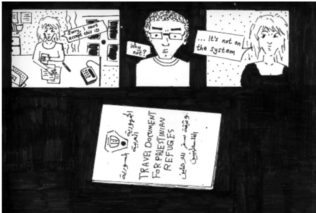
Figure 7: 'My Papers, My History' — Travel Document for Palestinian Refugees.