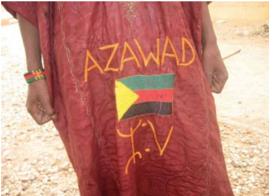
Figure 3: Azawad Flag on Clothes.