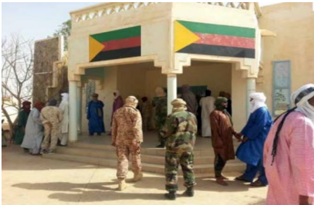
Figure 4: Administrative Centre in Kidal.