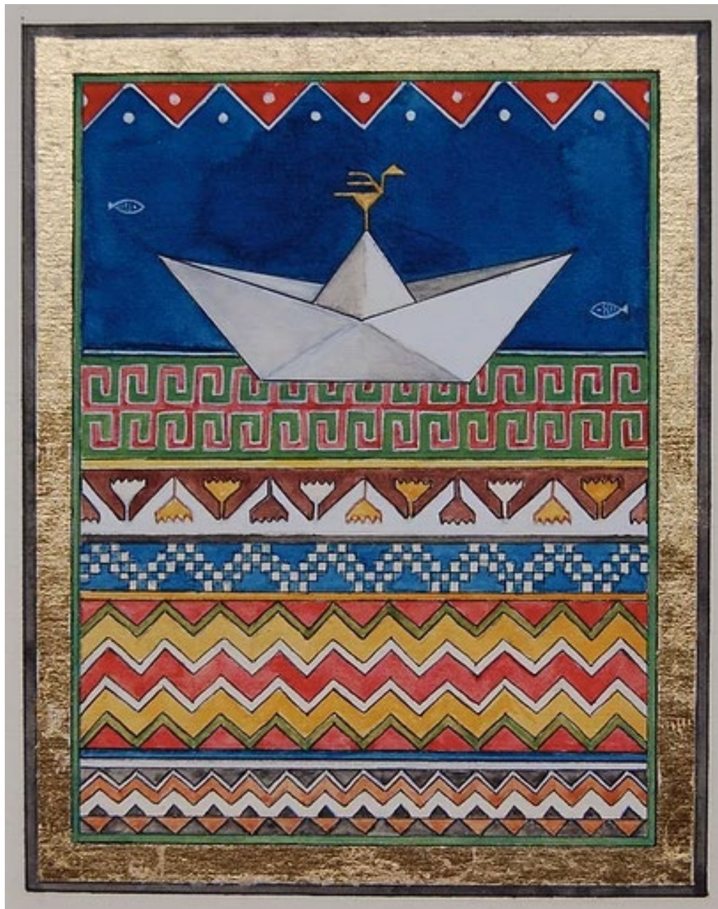
Figure 6: Migration.

colours and gold leaf, to keep the culture of his stateless population alive, whilst also portraying something that any European audience could relate to. 23 The assortment of colours, with stripes of water motifs symbolising journeys across oceans and a paper boat, framed with gold, show a journey that is not only marked by vulnerability but by hope and beauty. As citizens of the world, whether migrating or stationary, anyone can see their own story in this painting, to show experience is not marked by a bounded territory we ‘belong’ to, but is universal.